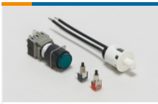
Push Button Switches(7)